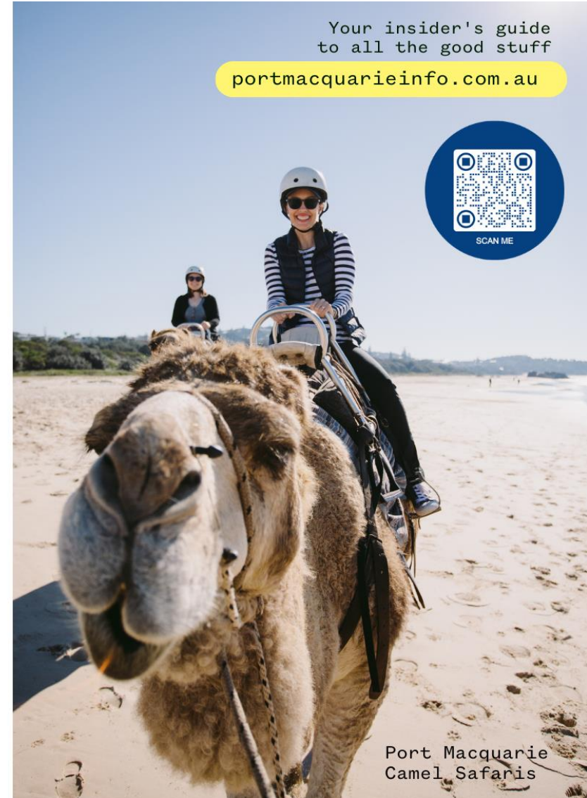
Port Macquarie Camel Safaris